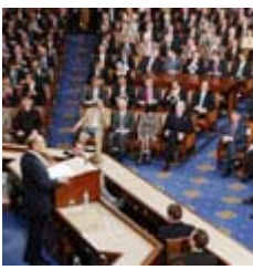
US Congress