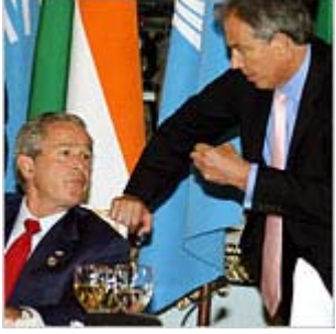
Cohen: Bush's 20 Cardinal Rules