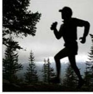
After 70 Miles, Racer Just Warming Up