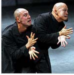
Expanding the Avignon Festival's Artistic Borders