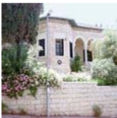
Costa Rica Embassy. Also leaving