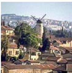
Jerusalem. No more embassies