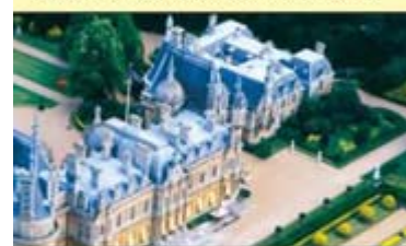
WADDESDON MANOR, WHERE BUFFET AND ARNOLD WERE PHOTOGRAPHED ABOVE - AT THE 2002 EUROPEAN ECONOMIC ROUND TABLE CONFERENCE...