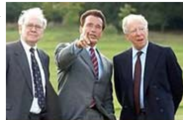
L. TO R: WARREN BUFFET, ARNOLD AND JACOB ROTHSCHILD

Jacob Rothschild was a close personal friend of the Princess Diana, and maintains strong personal and business links with Henry Kissinger. He knows Rupert Murdoch well, having been friends since the Australian newspaper proprietor first came to the UK in the 1960s. His country estate has been a regular venue for visiting heads of state including Presidents Ronald Reagan and Bill Clinton. Margaret Thatcher received French President François Mitterrand there at a summit in 1990. He hosted the European Economic Round Table conference in 2002, attended by such figures as James Wolfensohn, president of the World Bank, Nicky Oppenheimer, Warren Buffet and Arnold Schwarzenegger.