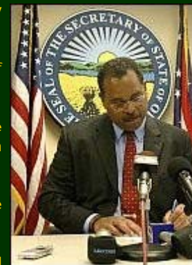
IN ON THE SCHEME Ohio Sec. of State 8

John Kerry: "Can I draw a conclusion that they played tough games and clearly had intent to reduce the level of our vote? Yes, absolutely. Can I tell