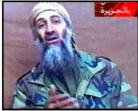
Bin Laden December 27, 2001 video

This is a man who was clearly not well. I mean, as you see from these pictures here, he's really, by December [2001] he's looking pretty terrible.