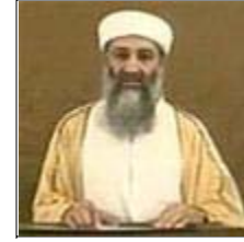
Fitter than ever in 2004

When you hear a threat which is "probably" made by bin Laden, just remember that he's "probably" dead.