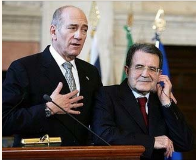
Olmert with Italian Prime Minister Romano Prodi at Villa Madama in Rome

In Rome, where Olmert met Italian Prime Minister Romano Prodi and Pope Benedict XVI, a television camera caught Olmert telling Prodi exactly what to say before a press conference.