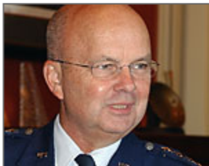
Gen. Hayden

Sources: The Associated Press; USA TODAY archives; The New York Times