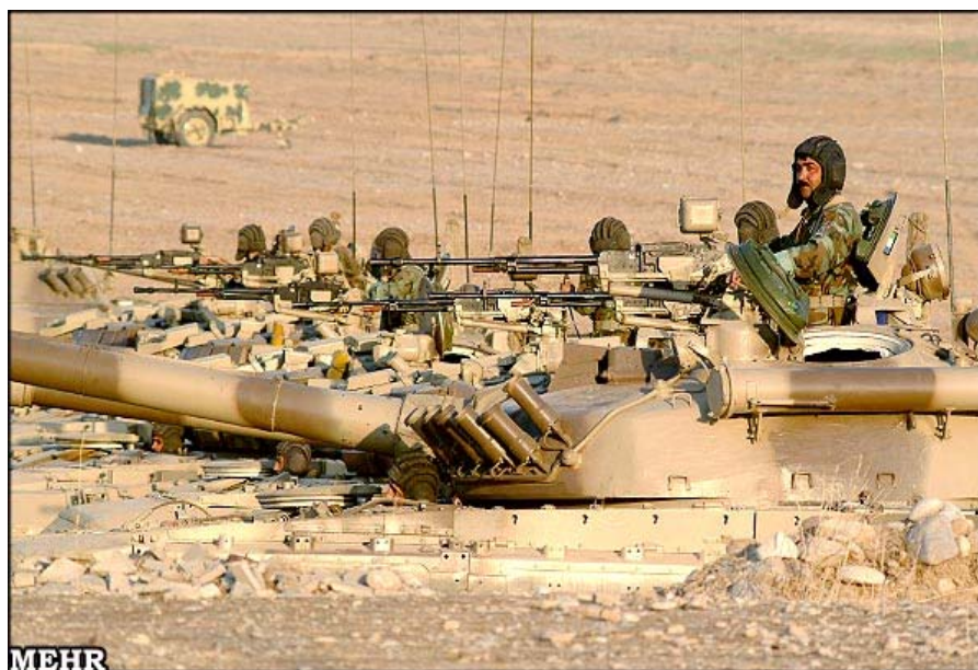
Iran War Games August 2006.

In late August, Iran was involved in the conduct of war games in major regions of the country, including border areas with Turkey, Iraq, Azerbaijan, Pakistan and Afghanistan. Iran's Defense Minister General Mostafa Mohammad Najjar has confirmed the deployment of enhanced military capabilities including weapons systems and troops on the Iranian border: "[Iranian] forces are supervising all movements by trans-regional troops and their agents around the Iranian borders" ( FARS news, 2 September 2006 )