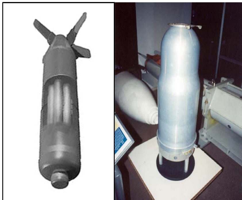
Tactical Nuclear Weapons: B61-11 NEP Thermonuclear Bomb

The use of tactical nuclear weapons by the US and Israel against Iran, is contemplated, ironically in retaliation for Iran's nonexistent nuclear weapons program.