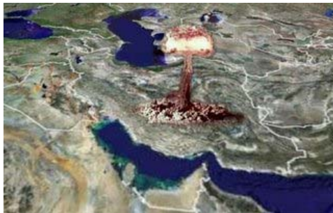
artist's impression of mini-nuke safe for civilians in Iran

According to a 2003 Senate decision, the new generation of tactical nuclear weapons or "low yield" "mini-nukes", with an explosive capacity of up to 6 times a Hiroshima bomb, are now considered "safe for civilians" because the explosion is underground.