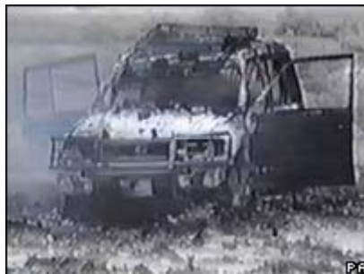
The ITN crew's vehicle was burnt out in the incident

He and his three colleagues were caught up in a firefight between US and Iraqi forces near the Shatt Al Basra Bridge on 22 March 2003.