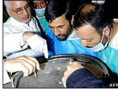
Iran insists its nuclear programme is for peaceful purposes

The UN nuclear watchdog has protested to the US government over a report on Iran's nuclear programme, calling it "erroneous" and "misleading".