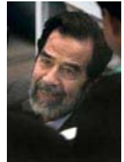
:: Lynching Saddam by Gabriele Zampanini

New and strange symptoms are reported amongst the wounded and the dead.