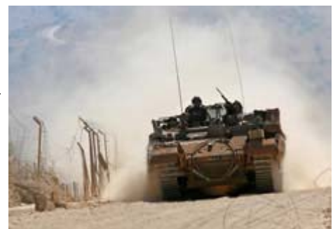
Hizbullah says it forced Israeli tanks to retreat.

CAIRO – Israel's retreat from two strategic Lebanese towns it captured during its ongoing war against Lebanon is a military tactic shell Hizbullah's bunkers with laser-guided bombs it recently obtained from Washington, a Lebanese military expert said on Friday, July 28.