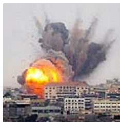
Previous attack in Lebanon