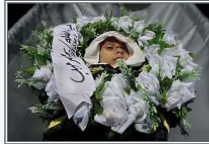
Gaza in mourning

Gaza- Ma'an- As a result of the ongoing Israeli aggression on the Gaza Strip, eighteen Palestinians lost their lives on Wednesday, of which four were children.