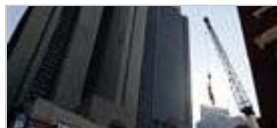
Stuntman Blaine to hang from hook in Times Square