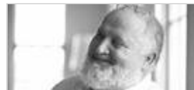
Don't knock the potato, says chef Michel Richard