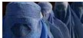
Dutch to ban wearing of Muslim burqa in public