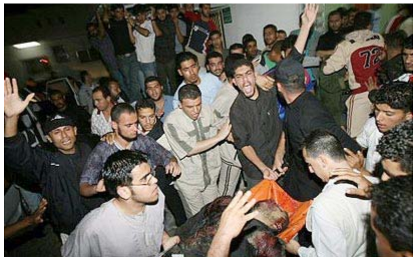
Gaza mayhem following IDF attack

Four Islamic Jihad members were killed and eight other Palestinians were wounded in the first IDF infiltration into the heart of Gaza since last summer's disengagement. According to the Palestinians, some innocent civilians were also among the casualties.