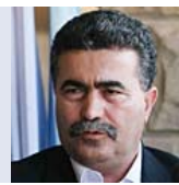
legitimacy in Lebanon

31 Talkbacks for this article. See all talkbacks