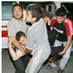
Evacuating the wounded in Gaza