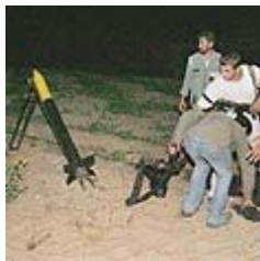
Qassam rocket cell in Gaza