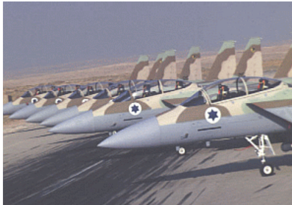
IAF F-15i squadron

IAF pilots have completed their mission training and fighter jets have been prepared for an Israeli attack on Iran, the British Sunday Times reported.