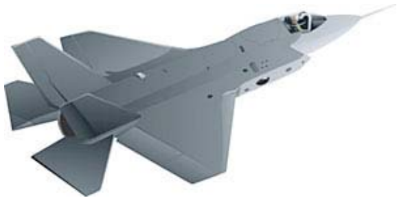
The F-35 fighter jet.

Print Edition Diplomacy Defense Opinion National Arts & Leisure Anglo File Sports Travel Magazine Week's End Q&A Business Underground Jewish World Real Estate Advertising Singles