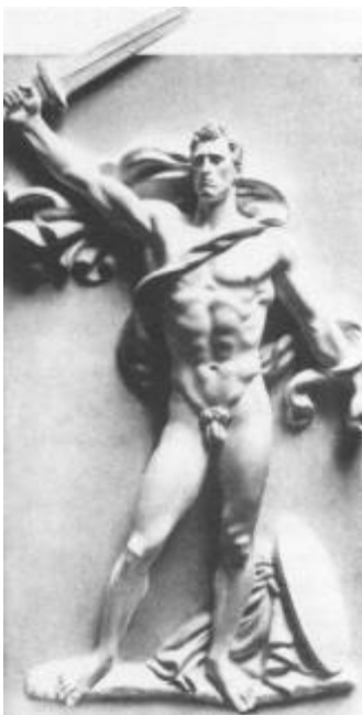
Arno Breker: 'Departure of the Warrior' (1942)

"Thus the Nuremberg Tribunal was and remains to this day a triumph of power over the law, committed by criminals who wrapped themselves in judges' robes.