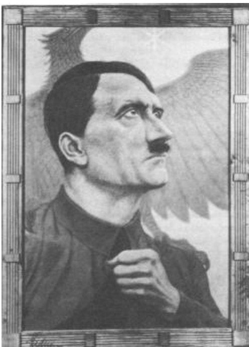
Adolph Hitler (Fidus, 1941)