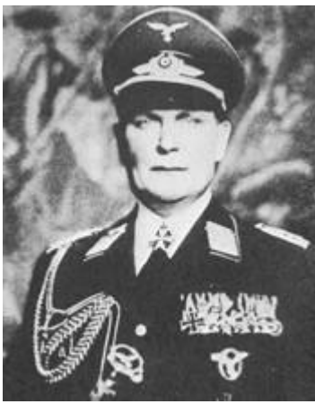
Reichsmarschall Hermann Goering