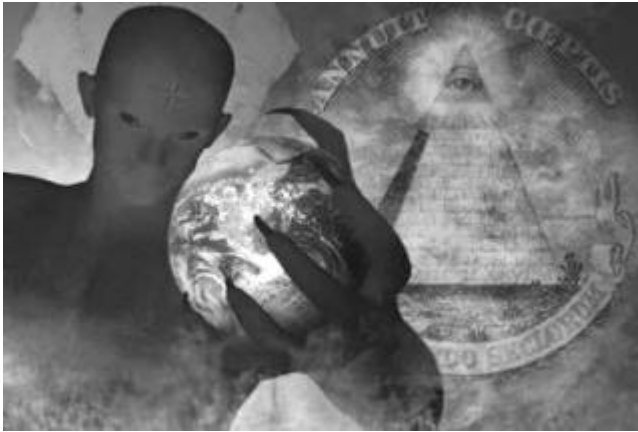
Pax Americana (Anon.)

must be avoided at all costs . . . it must not be allowed to come up.' That, however, would be possible only if Jackson could succeed as lawmaker, in setting up the rules of the game for a perfect trial by simply forbidding all discussion of the causes of the war before the tribunal. Jackson took Taylor's remarks as his guidelines and remarked: 'If all documents and statements to this effect are rejected by the court as irrelevant or unimportant, the war policies of the Western Powers, Poland and the USSR cannot be discussed.'