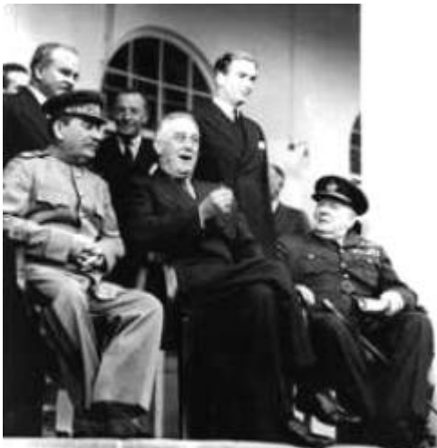
Troika: Stalin, Roosevelt, and Churchill

"None of that could be mentioned during the trial, of course. Germany must be branded and condemned as the sole guilty party, and the European war had to be presented as German aggression from the very beginning. Brigadier General Telford Taylor, later the chief American advisor for the prosecution, objected that it would not be possible in a fair trial 'to push through the absurd notion of Germany's sole guilt—rather, the opposite will come out.' Finally the USA had driven Hitler into a Polish trap from which he was unable to extricate himself: Churchill and Roosevelt had agreed on the complete annihilation of the German Reich from the very beginning.