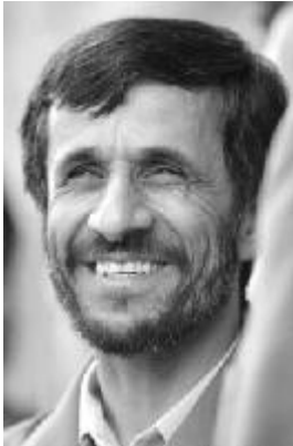
President Mahmoud Ahmadinejad