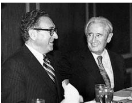
Nahum Goldmann (R) with Henry Kissinger