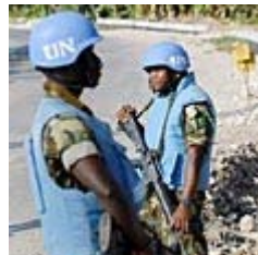
1701 an empty agreement