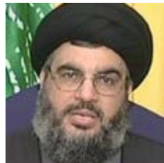
US-Israel: Nasrallah must die