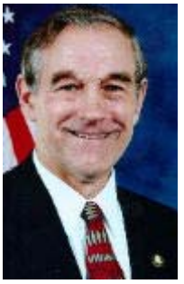
Ron Paul is a Republican Congressman from Texas. He was the 1988 Libertarian Party candidate for President.

Reproduction of material from any original Antiwar.com pages without written permission is strictly prohibited. Copyright 2003 Antiwar.com