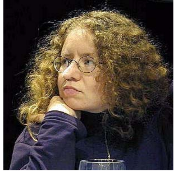
Canadian Jews Pray for Harper