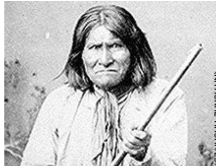
Geronimo is shown in picture taken in 1877.