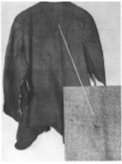
Photo of JFK's suit coat, showing that the bullet hole in the shirt and suit coat line up, discrediting the Warren Commission claim that the shirt had "bunched up" around JFK's neck when the bullet hit.