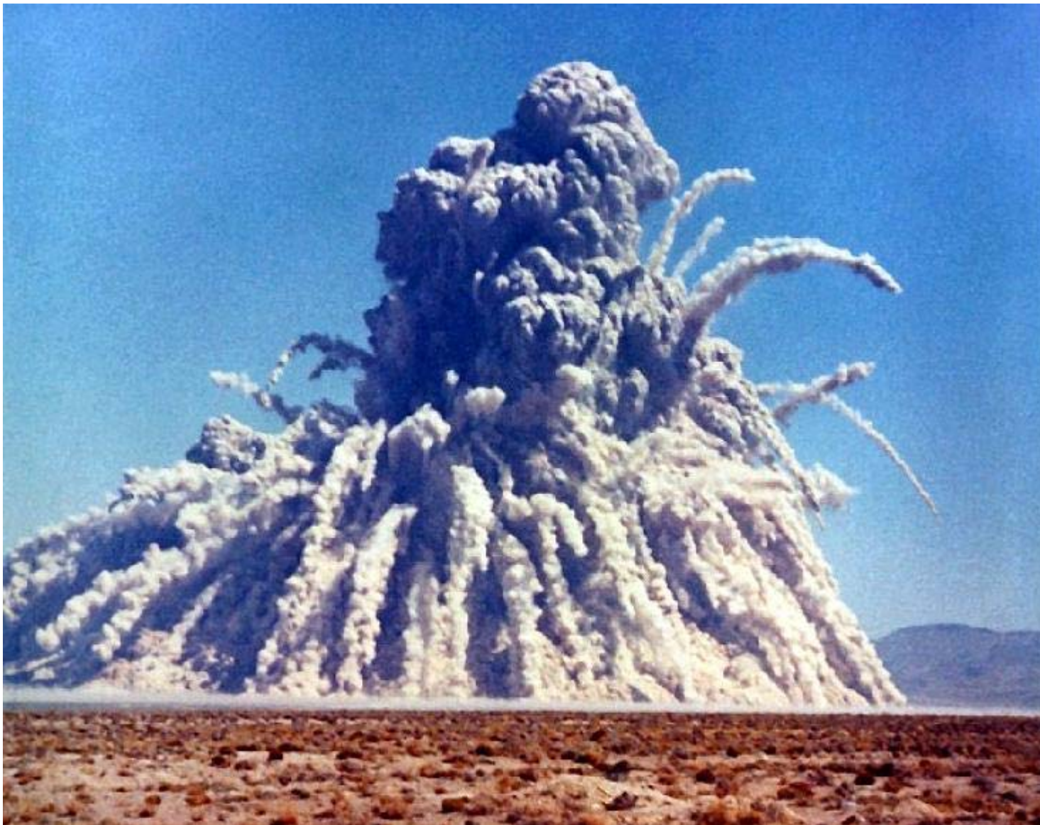
Storax Sedan 104 Kt shallow underground

In the upper picture the explosion is in theory 100 times stronger than in the picture below, but in practice the difference is only four times due to the capability of direction of the small hydrogen bomb.