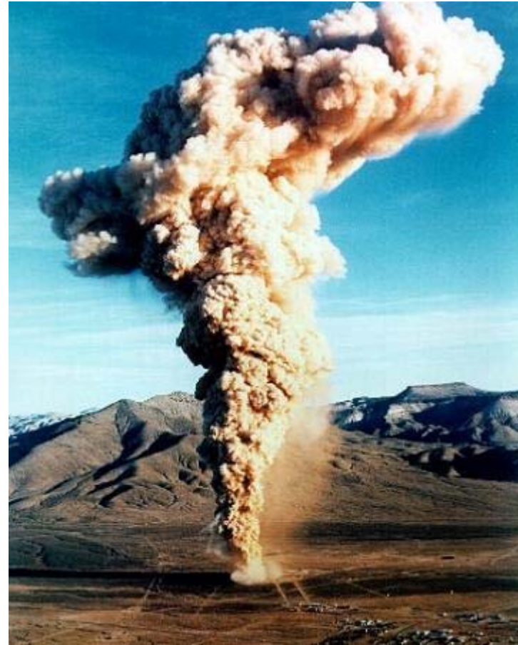
Banberry 10 Kt underground

Radioactivity in air creates shades of brown. (The subterranean nuke in the picture on the right is 10 times stronger than the small nuke on the left.) This is the reason why the FBI did not search the crime scene. Ground zeros of nuclear weapons are a health risk and belong to the FEMA.