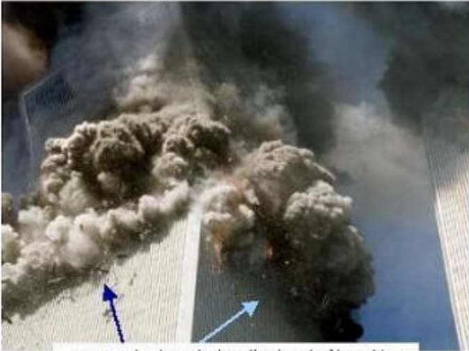
new explosions below the level of breaking.

On the left image the upper part is a whole piece. Seconds later the tilted position is corrected i.e. the upper part is pulverized. After that the pulverization of the stable standing trunk from above downwards is going to take place by continuing explosions - without any pressure form above because the upper part has already been pulverized.