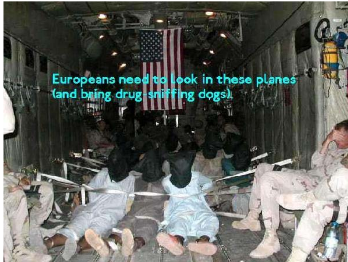
cia_cargo_plane_captioned.jpg, image/jpeg, 640x480

By Hallmark_cl@earthlink.net The US and European governments dare to deny this smoking-gun photographic evidence that: 1.--The CIA has been sneaking its prisoners in and out of Europe on cargo transport planes. 2.--CIA and foreign spy agencies work out of the same office (CTIC) in 31 countries. 3.--USA and European Union have an agreement for torture flights. Here is last copy left on the Web. 4.--Here are key passages of USA - EU torture pact. Here's how to download the rest. Public needs this information. News writers need this information. Investigators need it.