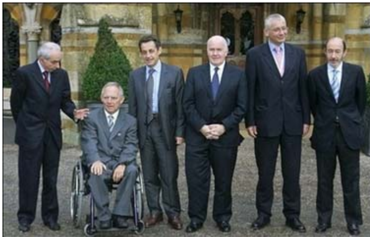
G6 Globalists scheme to destroy Internet freedom throughout Europe.

"The DVD of the resistance!" Get TerrorStorm on DVD today! Subscribe to Prison Planet.tv and see it in high quality or watch it for free at Google Video .