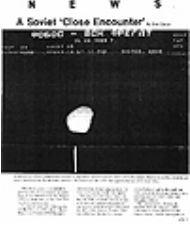
Last Image Before Russian Probe Was Lost