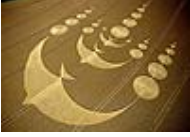
Walkers Hill Crop Circle