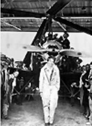
Amelia Earhart 1931