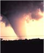
1973 Tornado in Oklahoma