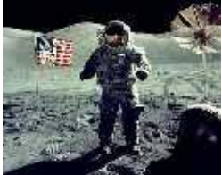
Astronaut Eugene Cernan