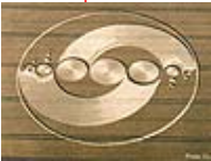
'Comet' type design

Prime Minister Manmohan. But the NAM summit at the very least has an anti- US flair, hiding with varying degrees of success under the bloc's defence of "multilateralism."