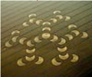
North Down Crop Circle