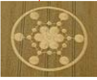
Scrope Wood Crop Circle