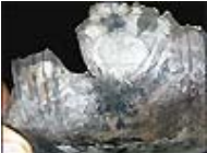
'Oldest religious icon in Americas'