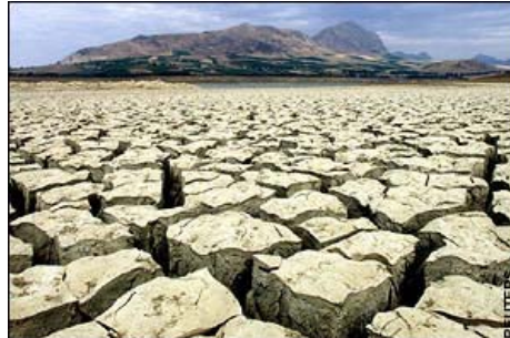
Biblical droughts, floods, plagues and extinctions?

Last week, Gordon Brown and his chief economist both said global warming was the worst "market failure" ever. That loaded soundbite suggests that the "climate-change" scare is less about saving the planet than, in Jacques Chirac's chilling phrase, "creating world government". This week and next, I'll reveal how politicians, scientists and bureaucrats contrived a threat of Biblical floods, droughts, plagues, and extinctions worthier of St John the Divine than of science.