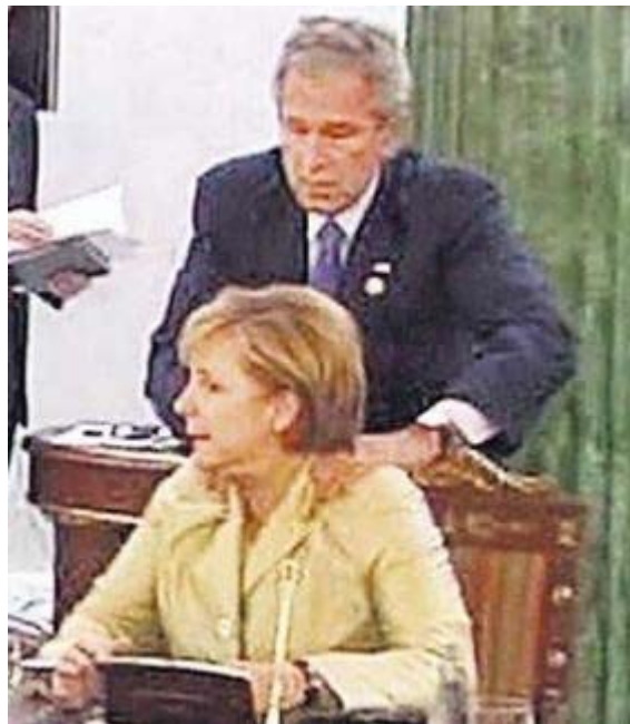
... suddenly the US president lays both hands on Merkel's shoulders ...