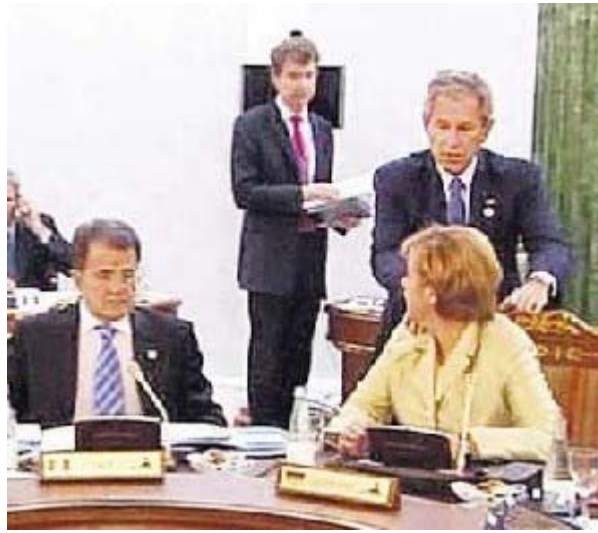
... Merkel converses with her neighbor at the table, does not notice how Bush is approaching from the rear ...