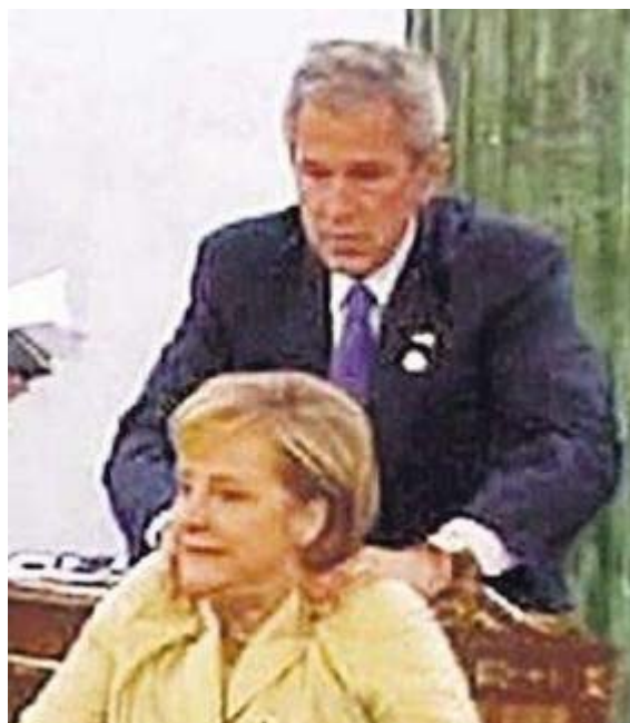
... begins his Texan one-second massage ...