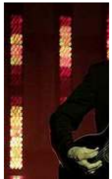
Pink Floyd co-founder concert at Neve Shalom

At the intersection of Jerusalem Arabs there is a problem in different terms of language it: