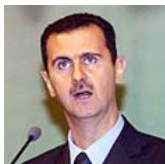
Syrian President Bashar Assad. 'Stood by Palestinians'