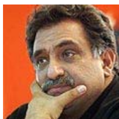
MK Azmi Bishara. 'Israel may attack'