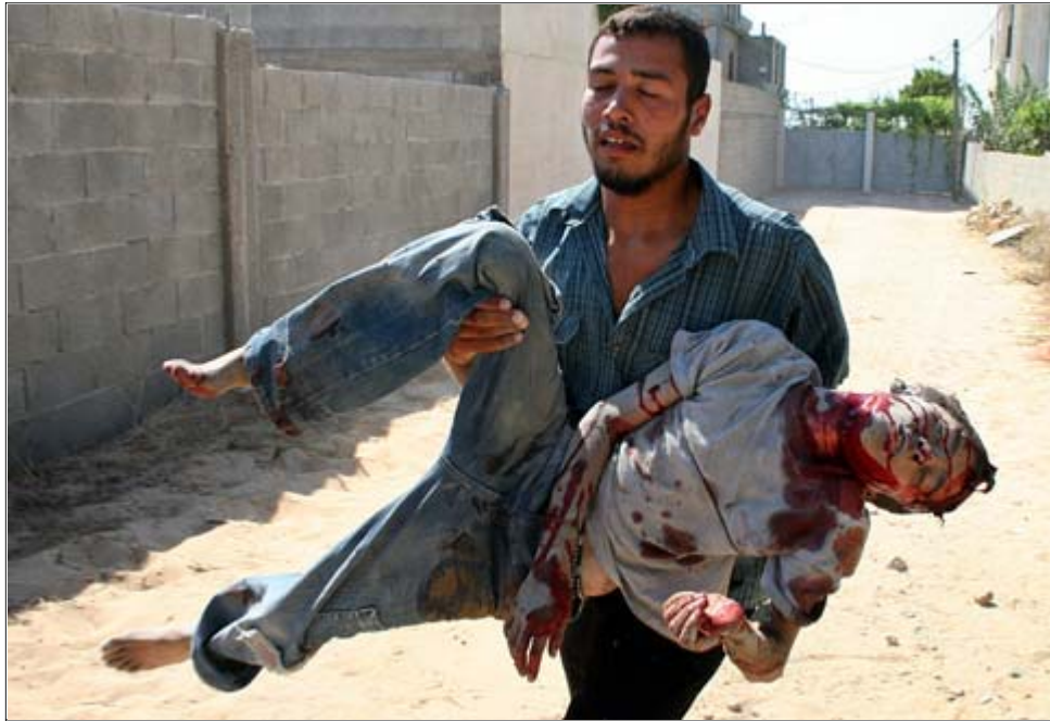
A Palestinian carrying the body of a murdered boy after Israeli mobile artillery fired shells at Beit Lahiya in the northern Gaza Strip July 6, 2006.

Arab Media Watch expresses its concern at the amount of coverage given to Israel's killing yesterday of almost two dozen Palestinians, including civilians, compared with the kidnapping of an Israeli soldier on 25 June, as well as the continued portrayal of the current crisis as being triggered by the kidnapping.