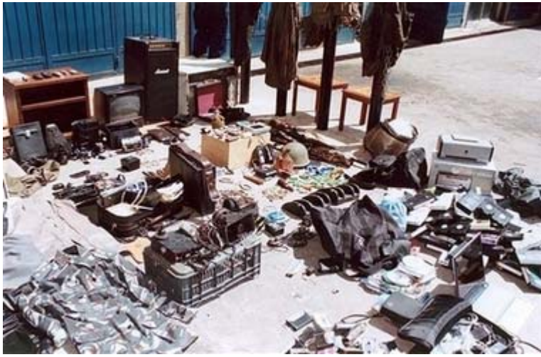
Lebanese army shows a picture of the Mossad documents and equipment captured