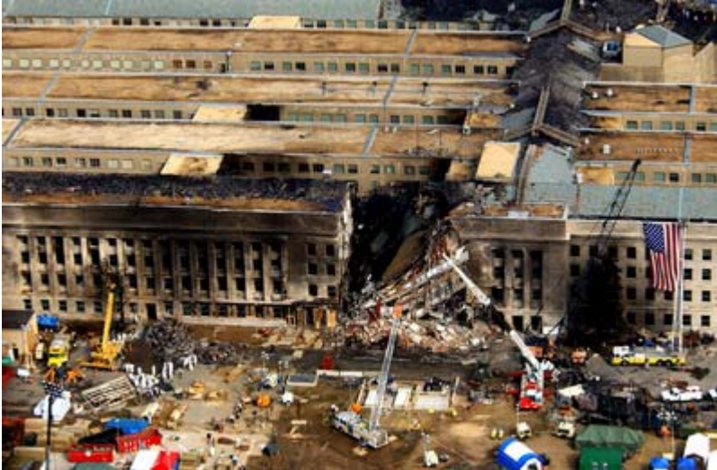
Pentagon's final damage:

The TV media primarily showed us pictures after the outer wall of the Pentagon collapsed some 20 minutes after initial impact. Here is a picture of the