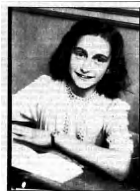
Anne Frank - a writer of precocious talent. In a 'diary' entry of 29 March 1944 Anne Frank described her book as " een roman ," a novel, but this is incor-

"A noteworthy decision of the New York Supreme Court confirms this point of view, in that the well known American Jewish writer, Meyer Levin, has been awarded $50,000 to be paid him by the father of Anne Frank as an honorarium for Levin's work on the Anne Frank Diary."