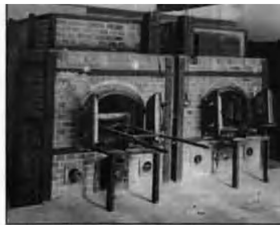
Two crematoria ovens: the number of Jewish corpses allegedly disposed of without trace, via such ovens, is improbably high

Russian prison camp before being sent to Ravensbruck, the German camp for women detainees, in August 1940. She noted that she was the only person in her contingent of deportees from Russia who was not straightaway released by the Gestapo. Her book presents a striking contrast between the camps of Soviet Russia and Germany; compared to the squalor, disorder and starvation of the Russian camp, she found Ravensbruck to be clean, civilised and well-administered, Regular baths and clean linen seemed a luxury after her earlier experiences, and her first meal of white bread, sausage, sweet porridge and dried fruit prompted her to inquire of another camp inmate whether August 3, 1940 was some sort of holiday or special occasion. She observed too that the barracks at Ravensbruck were remarkably spacious compared to the crowded mud hut of the Soviet camp. In the final months of 1945, she experienced the progressive decline of camp conditions, the causes of which we shall examine later.