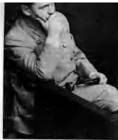
Hermann Goering at Nuremberg. He dismissed the Six Million accusation as propaganda fiction.

the first time he had heard of it "was right here in