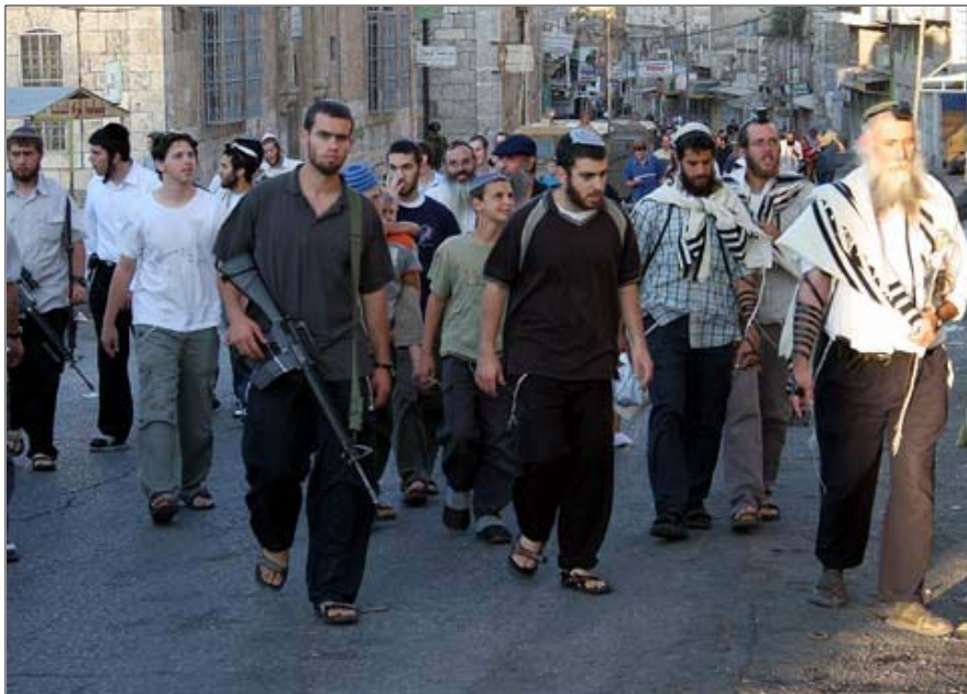
Israeli soldiers impose curfew in the West Bank city of Hebron to allow Israeli settlers to visit and pray in Hebron, 3 August 2006. ( MaanImages/Mamoun Wazwaz )

IOF have continued to impose severe restrictions on fishing in the Gaza Strip. Following the attack on IOF on 25 June 2006, IOF prevented fishing. Approximately 35,000 people in and around Gaza's coastal communities rely on the fishing industry, including 2,500 fishermen, 2,500 support staff and their families. Fishermen have been subjected to intensive monitoring by IOF, which use helicopter gunships and gunboats to monitor the fishermen. On a number of occasions, IOF has opened fire against the civilian fishermen in order to enforce the 9 nautical mile limit imposed on them. The Oslo Accords make provision for Gaza's sea to be fished to 20 nautical miles.