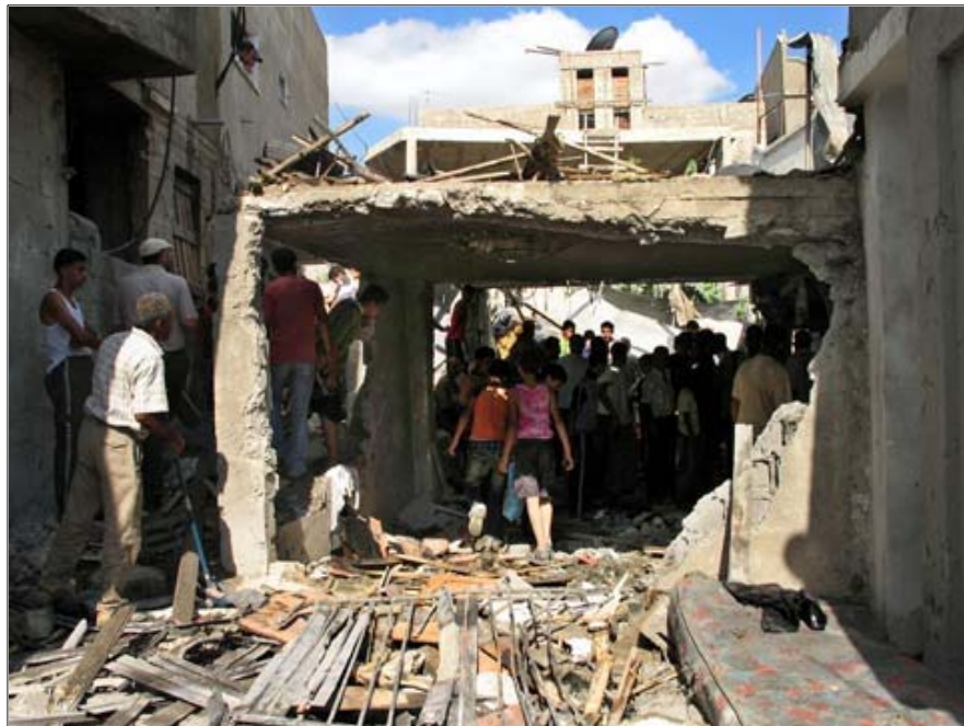
The demolished house were Saraya Al-Quds militants were extra-judicially executed by Israeli in the West Bank city Jenin, 9 August 2006.