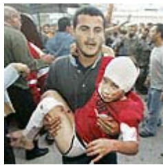
Results of IDF shelling in Beit Hanoun