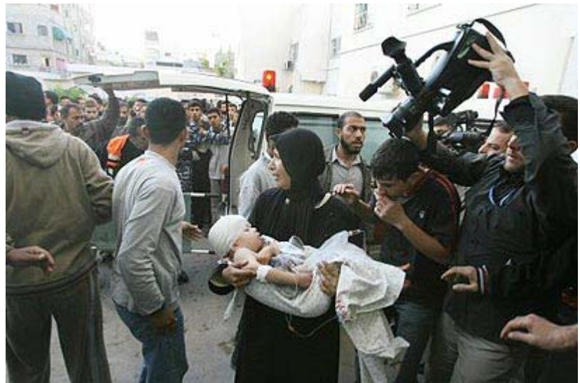
Injured evacuated in Beit Hanoun

While the defense establishment is looking into the harsh reports from Beit Hanoun, IDF officials made it clear that there was no intention to hit populated areas.