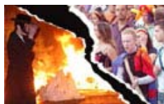
Full coverage of the Jerusalem gay parade controversy