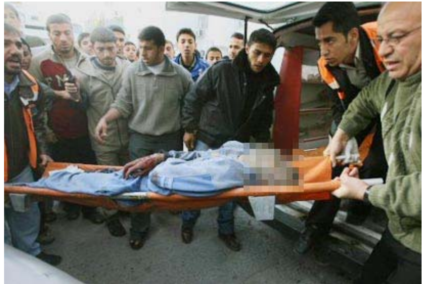
Beit Hanoun, Wednesday morning

Palestinian sources in Gaza reported that some of those killed were hurt after shells hit a group of civilians who arrived to aid those hurt in the first barrage. Residents in the area were called to donate blood for fear that the number of casualties would be higher.