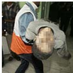
Injured child evacuated