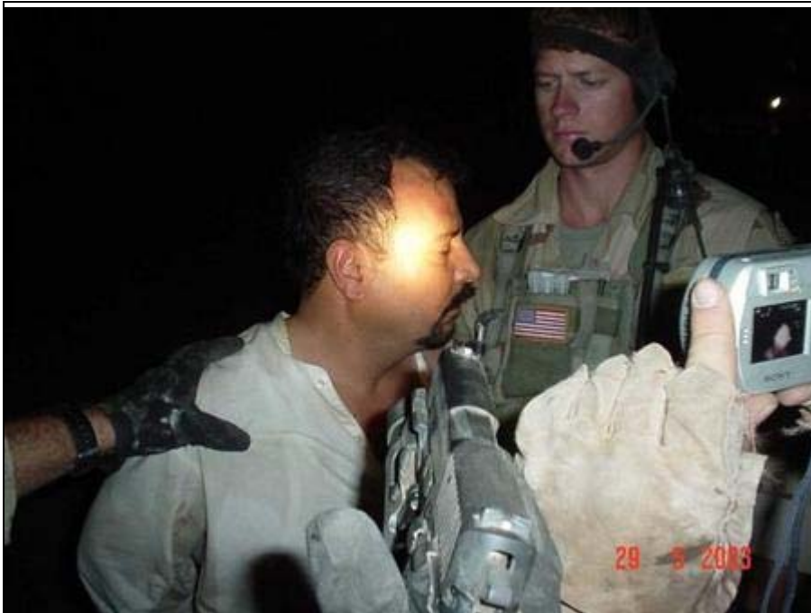
A photo found posted on a commercial photo-sharing Web site operated by a woman who said her husband brought the photos from Iraq after his tour of duty appears to show a prisoner having his picture taken at

The wife said she was upset that a reporter was able to view the album, which includes family snapshots. Hundreds of other photos depict everyday military life in Iraq, some showing commandos standing around piles of weapons and waving wads of cash.