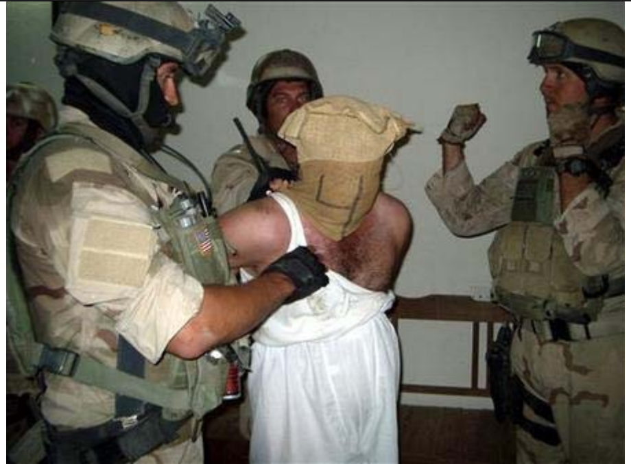
A photo found posted on a commercial photo-sharing Web site operated by a woman who said her husband brought the photos from Iraq after his tour of duty appears to show a subject constrained by U.S. military personnel. The Navy SEALs have launched a criminal investigation into photographs that appear to show commandos sitting on hooded and handcuffed detainees, and photos of what appear to be bloodied prisoners.

These and other photos found by the AP appear to show the immediate aftermath of raids on civilian homes. One man is lying on his back with a boot on his chest. A mug shot shows a man with an automatic weapon pointed at his head and a gloved thumb jabbed into his throat. In many photos, faces have been blacked out. What appears to be blood drips from the heads of some. A family huddles in a room in one photo and others show debris and upturned furniture.