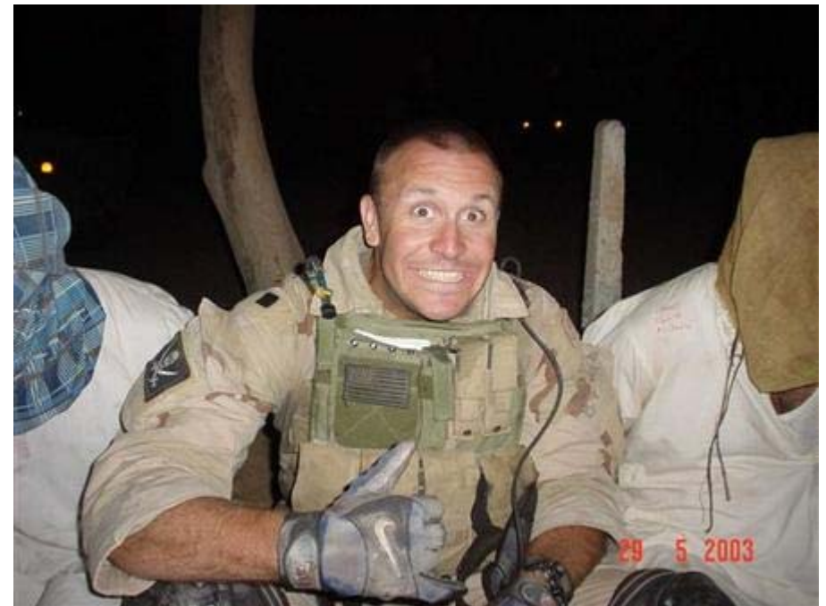
A photo found posted on a commercial photo-sharing Web site operated by a woman who said her husband brought the photos from Iraq after his tour of duty apparently shows a U.S. military member posing with hooded prisoners in a

The images were posted to the Internet site www.Smugmug.com . The woman who posted them told the AP they were on the camera her husband brought back from Iraq. She said her husband has returned to Iraq. He does not appear in photos with prisoners.