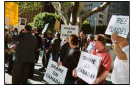
Demonstrators in downtown Los Angeles, Feb. 4, 2005 call for Zundel's release