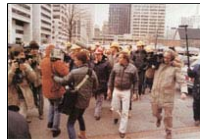
Toronto Holocaust trial, 1980s