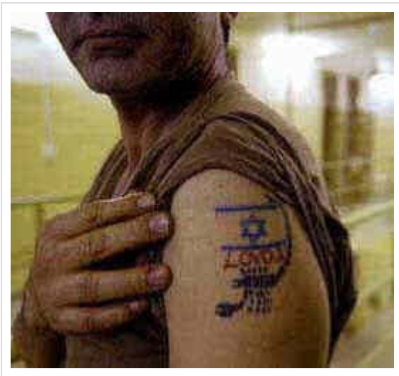
Contractor pride in Iraq

When Marines are ambushed in Iraq, is it Iraqi resistance fighters or Israeli contractors?