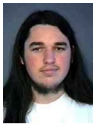
Gadahn (Adam Pearlman) without "Al-Qaeda" head gear