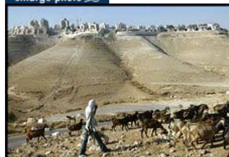
A Bedouin shepherd walks with his sheep past the Israeli settlement of Maale Adumim, the West Bank's largest settlement, not far from Jerusalem.