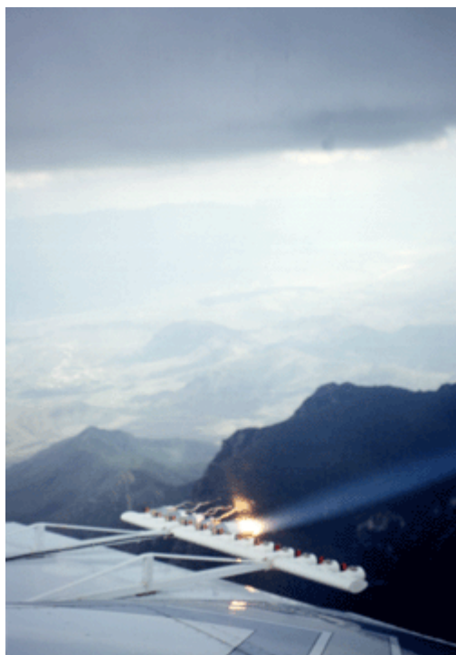
Airborne hygroscopic flares emit water-attracting particles into cloud updrafts during a recent cloud-seeding project in Mexico.

Check Out this local Government web page on Weather Modification. It's Amazing how people still believe that this science does not exist!