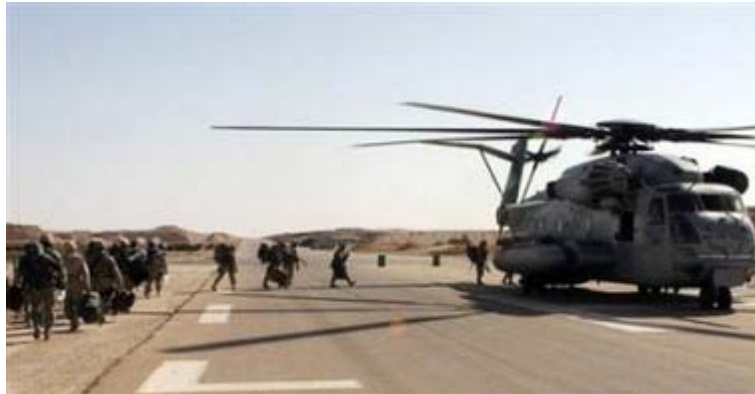
Operation Steel Curtain Al-Anbar Province. Al-Qa'im. Terrified Residents Flee Iraq Fighting