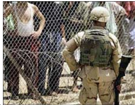
The ICRC described the US abuses against Guantanamo detainees as war crimes.

The ICRC, the guardian of the Geneva Conventions governing conduct in warfare, lambasted late last year "utter contempt" for humanity in US-occupied Iraq.