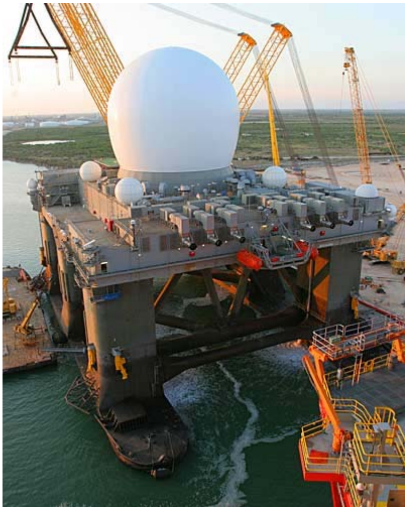
Boeing-led Sea-Based X-Band Radar (SBX)

As prime contractor for the GMD program, Boeing is responsible for the development and integration of the GMD system components, including the SBX; ground-based interceptor; battle management, command, control and communication systems; early warning radars; and interfaces to the defense support program early warning satellite system. Raytheon built the SBX radar.