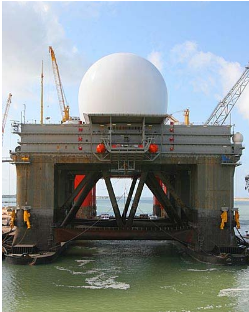
Boeing-led Sea-Based X-Band Radar (SBX)

The August 1 contract only covers activities during the first phase of a four-part program. During the initial phase, which lasts until October of this year, Boeing will do preliminary design work and reserve construction materials for building the sea-based platform.