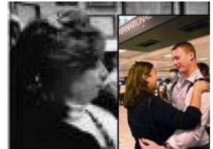
The Aliens Just Stepped Out of the Tripod at Baghdad International